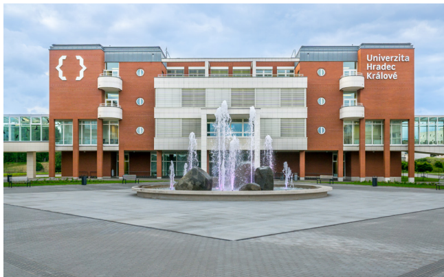
J – Faculty of Informatics and Management (Hradecká 1249)