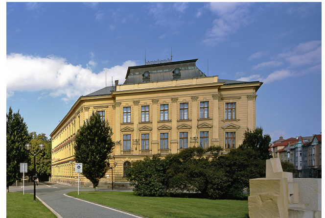
B – Philosophical Faculty (nám. Svobody 331)