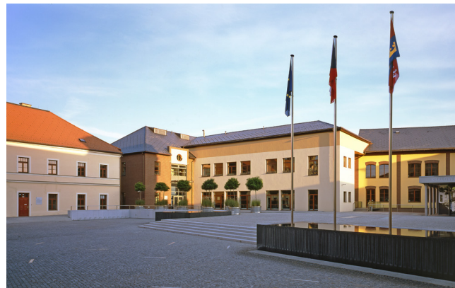
P – Department of Art, Visual Culture and Textile Studies (Pivovarské náměstí 1244/1)