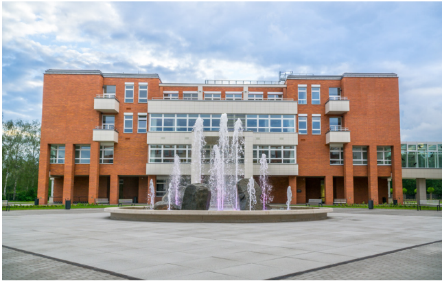
S – Faculty of Science (Hradecká 1285)