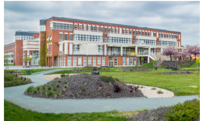
A – House of joined education (Hradecká 1227)