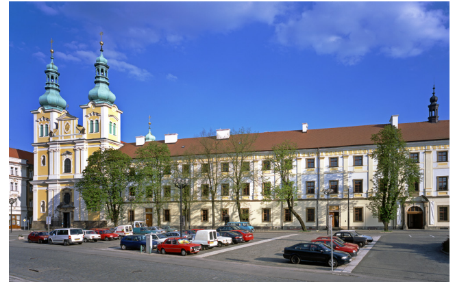
F – Department of Music (Velké náměstí 32)