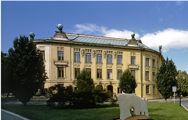
C – Faculty of Education (nám. Svobody 301)