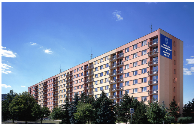
K – University Halls of Residence (Palachova 1129)