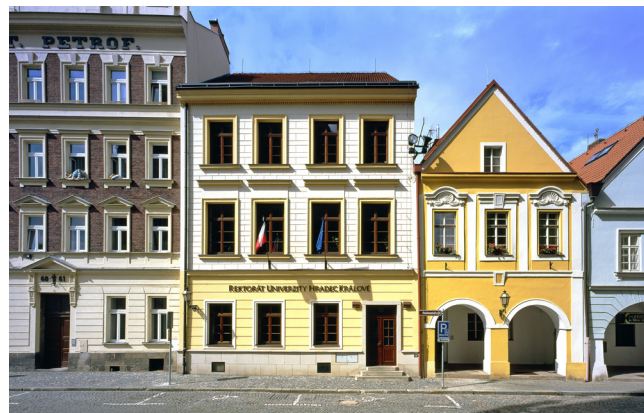
R – Rectorate (Rokitsanského 62)