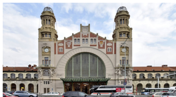
Fantova budova - historical part of the main train station in Prague