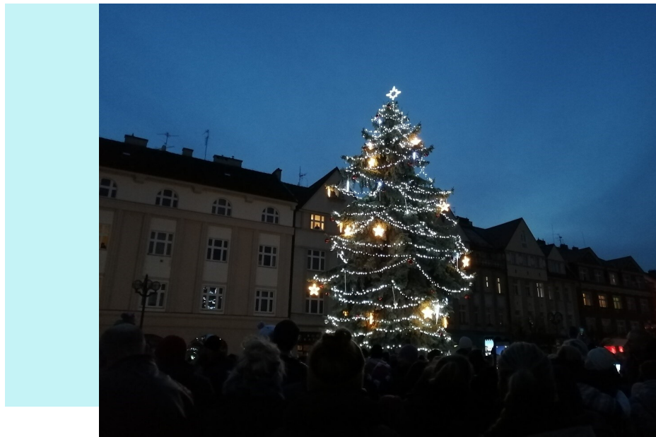
Lighting up the Christmas tree in Hradec Kralove

Hradec Králové has become a really important city for me for practical and sentimental reasons. It has a perfect size if you like a peaceful but fun life. It is not too small but you can still walk almost everywhere, especially from the dorms to the faculty. It's nice to walk around the big main square and through the small streets. It is not super crowded and noisy like Prague, but you can still find things to do. And if you are missing the messiness of big cities, you can always go easily to Prague, but you'll want to come back soon. Hradec Králové is the place where I spent not only a semester but where I lived my best experiences, memories and where I met the most amazing people. Definitely, this was an experience I will not forget and a place I want to come back to.